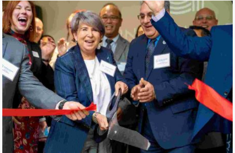
Gurnick Academy of Medical Arts commemorated 20 years last month at the school's flagship campus in San Jose (Calif.) on Friday, October 25.