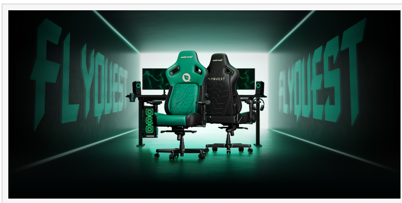
AndaSeat FlyQuest Edition 2024

Championship Legacy Takes Form FlyQuest secured their position in esports history with a quarterfinal appearance at the 2024 World