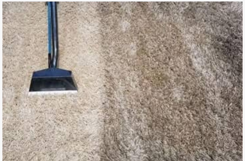
Steam cleaning an area rug, before and after