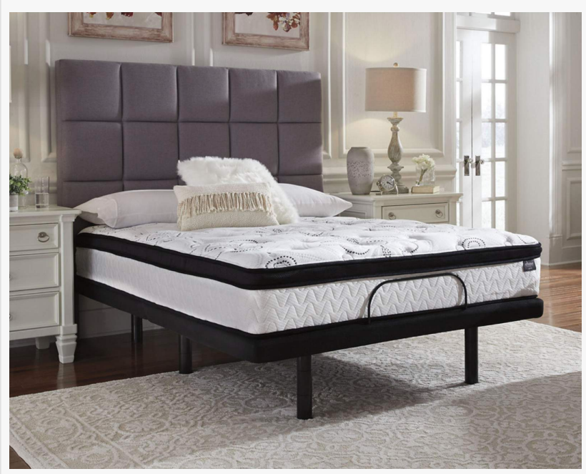
home furniture mattress