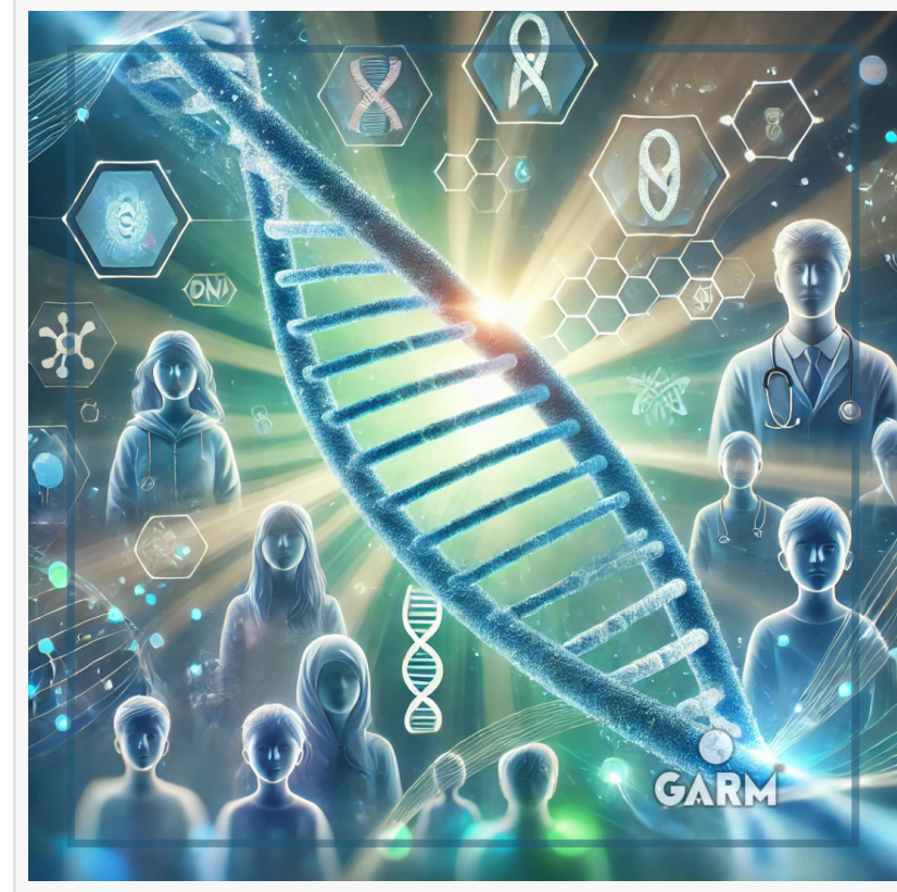
Gene therapy for emerging generations

Gene therapy also raises important ethical questions about its application.