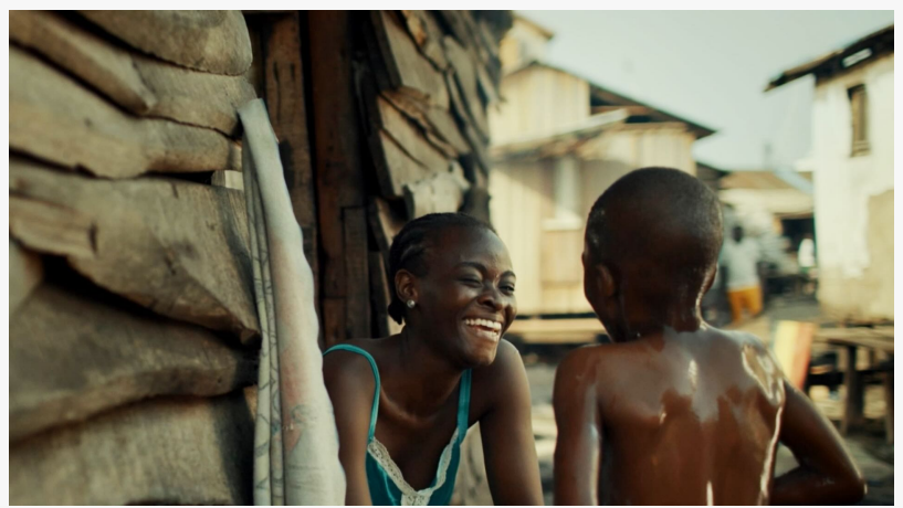
The Legend of the Vagabond Queen

With 65 films from 32 countries—including half as US or NY premieres—ADIFF NY 2024 presents a robust and culturally relevant program. Screenings will be held at Teachers College, The Forum at Columbia University, Leonard Nimoy Thalia Theatre, and Cinema Village from November 29 to December 15, 2024.