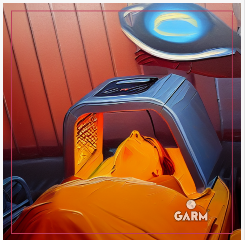
Light Therapy GARM Aesthetics