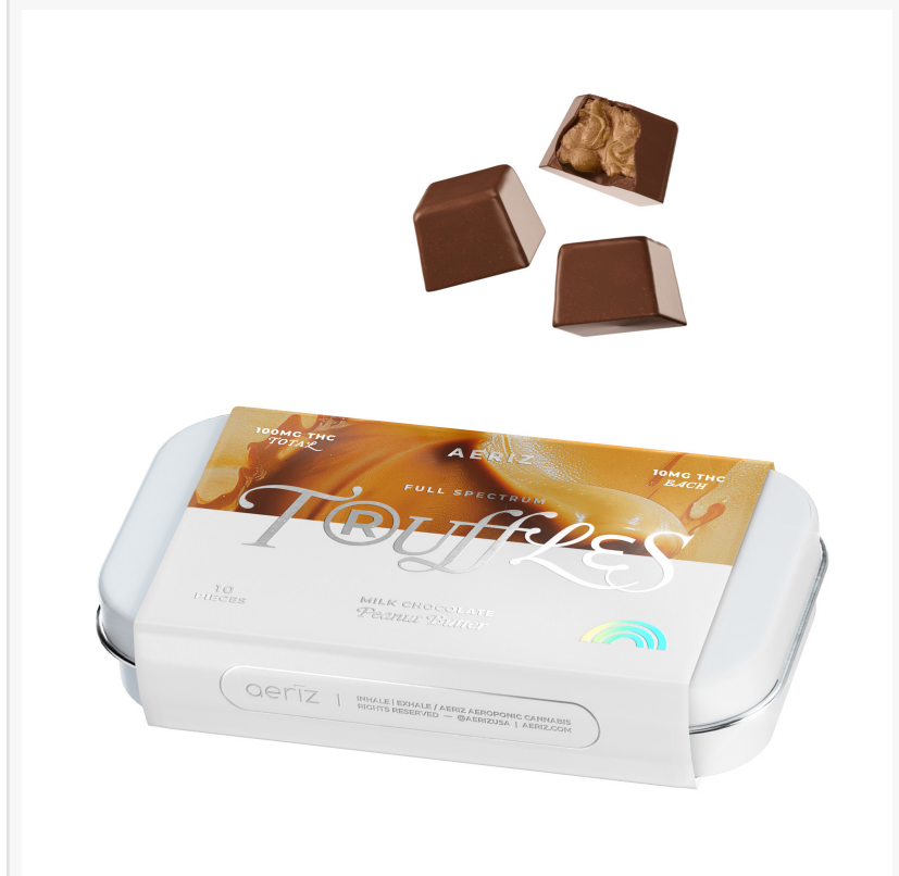
Milk Chocolate Peanut Butter