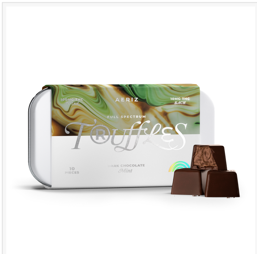
Dark Chocolate Mint

Founded in 2015, Aeriz, is a multi-state cannabis operator based in Chicago, Illinois. As the largest cannabis cultivator in Illinois and the largest aeroponic cultivator in the world, the company utilizes reusable clay beads instead of soil and recycles nutrients and water through a closed-loop system. Beyond its flagship brand Aeriz, the company has a large brand portfolio, including UpNorth, Fig Farms, Daze Off, and 93 Boyz, with retail partners in Illinois, Arizona and California.