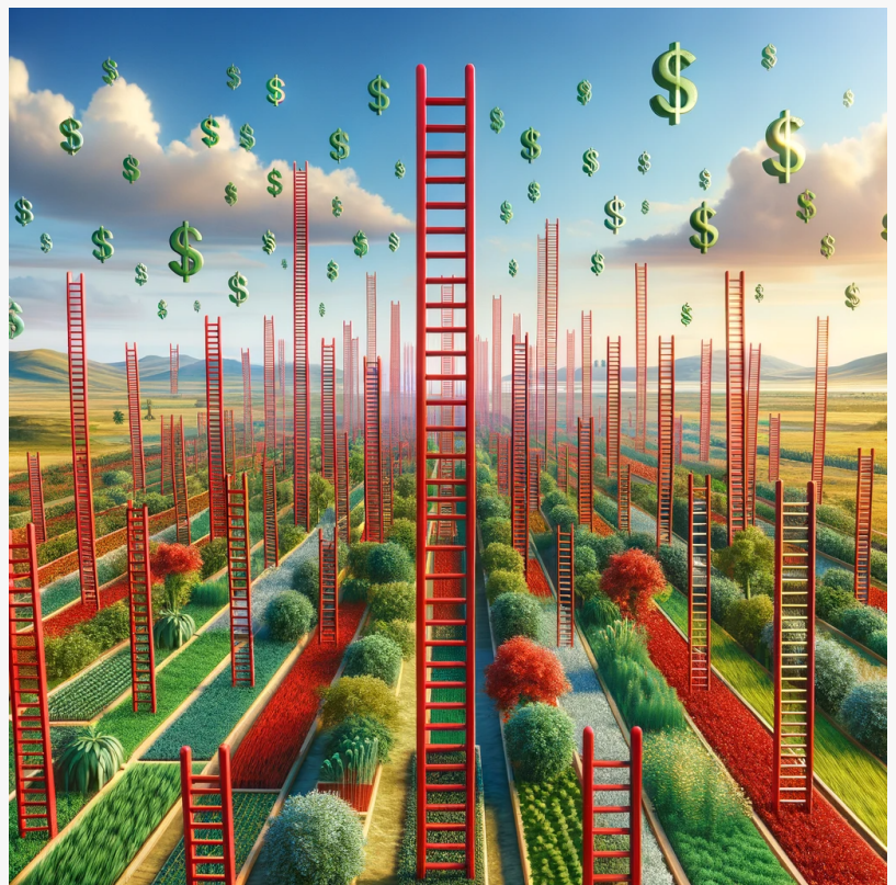
RedLadder's field of growing ladders

CaringBridge is a no-cost, 501(c)(3) nonprofit health platform that surrounds family caregivers with support while they care for a loved one on a health journey. A donor-supported nonprofit founded in 1997, the organization offers tools to share and document a health journey, simplify care coordination, and connect caregivers with a supportive community. CaringBridge addresses feelings of overwhelm, isolation, and loneliness by improving emotional health and social connectedness, helping people come together in support of healing. With 320,000 people on the platform every day sending or receiving support, there are over 1,600 messages of love, hope, and compassion posted every hour. And every 12 minutes a new CaringBridge page is started. The CaringBridge community includes all 50 states and more than 242 countries around the world.