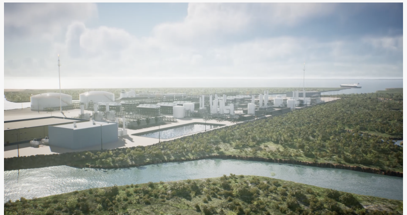
Argent LNG Back