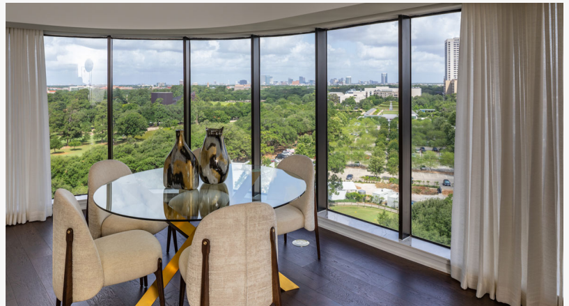
Houston high rise condos