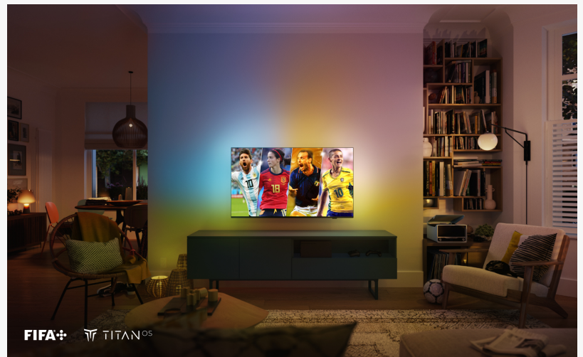
Fifa x Titan OS Set Up

With the launch of the FIFA+ channel, football fans across the continent will be able to enjoy a first-class viewing experience right in their living rooms, with a selection of live matches, full match replays, documentaries, original series and exclusive content that offers an in-depth look at the world of football. From historic FIFA World Cup and FIFA Women's World Cup moments to specially curated match highlights.