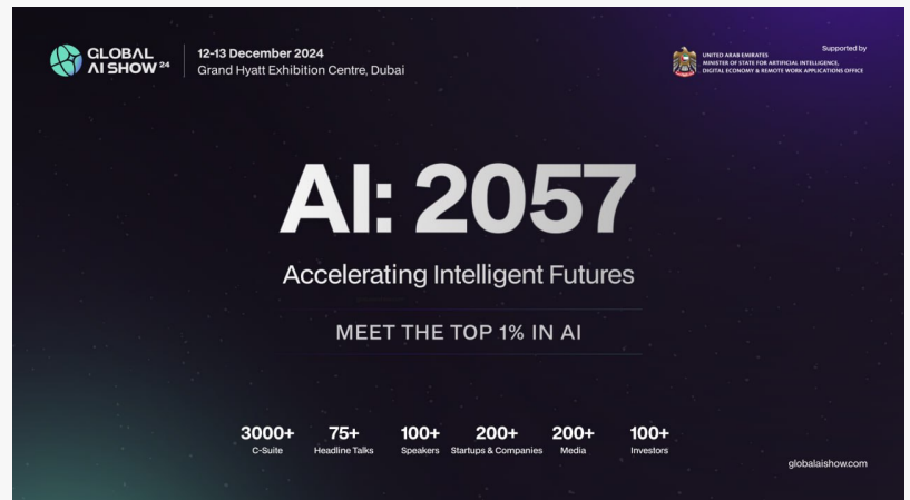
VAP Group announces the 2nd edition of the Global AI Show at the Grand Hyatt Exhibition Centre, Dubai