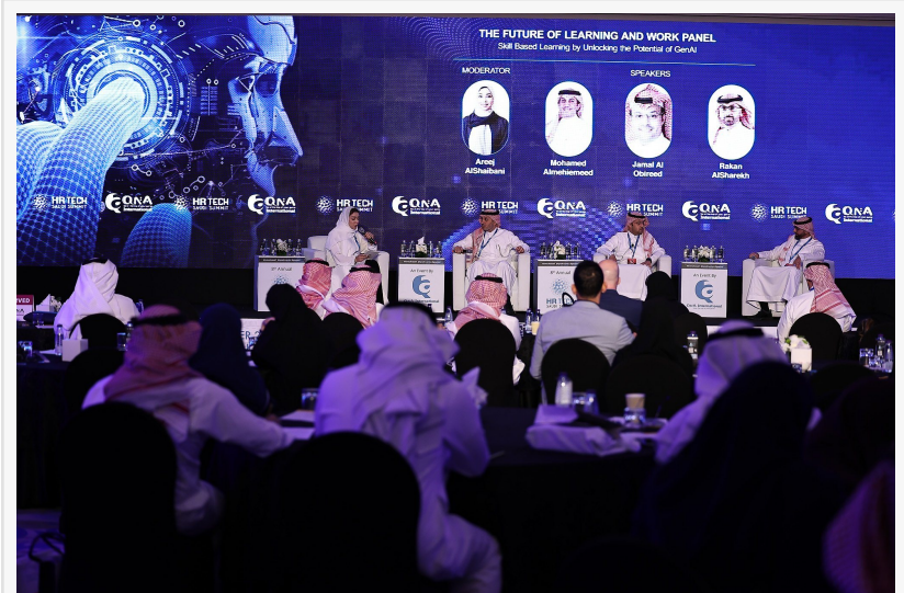
8th Annual HR Tech Saudi Summit Champions AI-driven HR Transformation