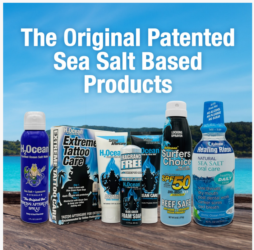
H2Ocean Original Sea Salt Based All Natural Products