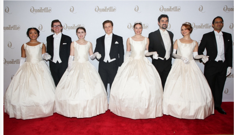
Participants for the 64th Annual Quadrille Ball in February 2025

The annual ball is a fundraiser for scholarships awarded to highly qualified students enrolled at U.S. or German universities. The Quadrille was founded decades ago to enhance and strengthen transatlantic relationships through education and exchange. Through its non-profit parent organization, the German-American Scholarship Association, the Quadrille supports undergraduate, Master and PhD students.