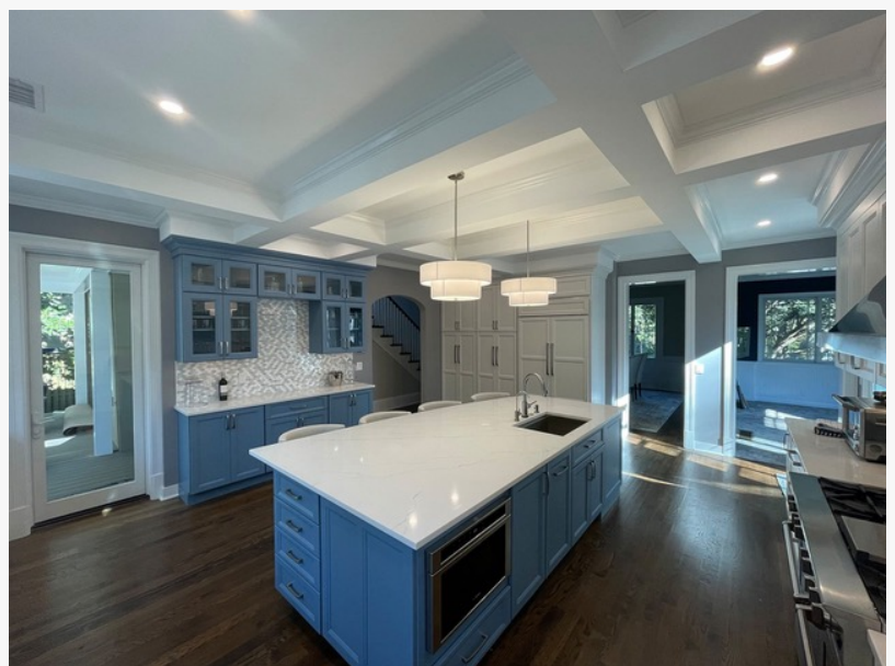
Managed Renovations Kitchen Remodel

If the cold has already crept into the home, it's a clear sign that upgrades might be overdue. Comprehensive home remodeling during the winter months can address those sneaky drafts, uneven heating, and outdated layouts. With strategic renovations—like improving insulation or upgrading to energy-efficient windows—homeowners can quickly feel a difference in warmth and comfort.