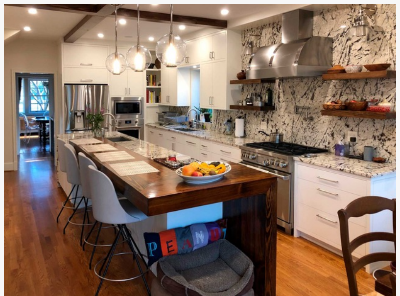
Managed Renovations Kitchen Remodel