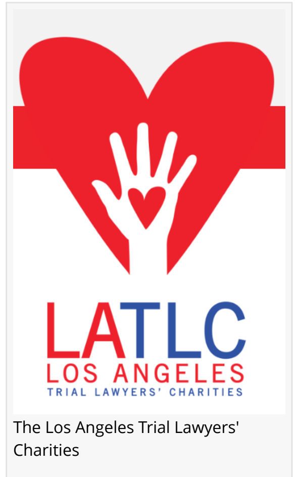
The Los Angeles Trial Lawyers' Charities

One of the event's highlights will be Santa and Mrs. Claus's grand entrance, arriving with a motorcade of luxury "reindeer" cars escorted by LAPD motorcycles and helicopters. The festive