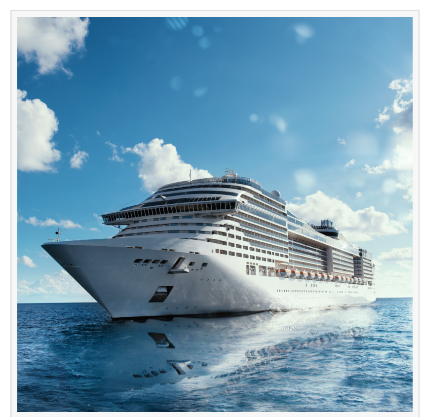
Winter cruises are a great way to relax over the holidays!

GigSky, a leading mobile virtual network operator, has launched its highly anticipated All-in-One eSIM Plan for winter travel. This innovative plan offers seamless connectivity from the tropics to the high seas, including Caribbean eSIM data plans, unlimited plans valid across the region, and plans for cruise ships. With free 100mb trials, GigSky provides unmatched service and support for travelers looking for the ultimate data plan.