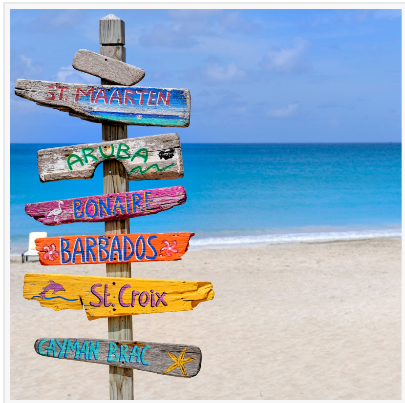
The Caribbean is one of the most popular travel destinations during the winter.

For more information on GigSky's All-in-One eSIM Plan and to sign up for a free trial, visit their website at <a href="https://www.gigsky.com">www.gigsky.com</a>. Stay connected and stress-free during your winter travels with GigSky's revolutionary eSIM plan.