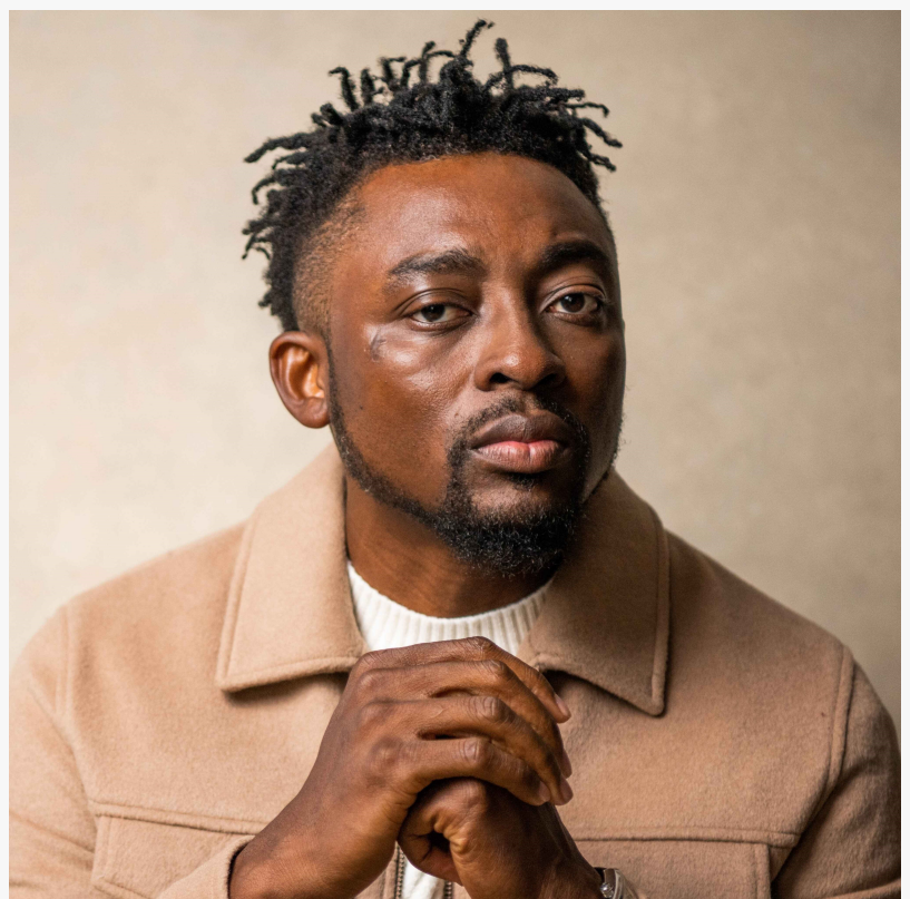
Bambadjan Bamba, Actor and DACA Advocate; Photo Credit: Jordan Engle

LOS ANGELES, CA, UNITED STATES, November 21, 2024 / EINPresswire.com/ -- Award-winning actor and immigrant rights advocate Bambadjan Bamba , best known for his roles in Black Panther and The Good Place , is thrilled to announce the launch of the Afro Poncho Collection from his Afrocentric streetwear brand, Bogolonfini . This new collection, crafted by local artisans in Côte d'Ivoire (Ivory Coast), combines traditional African craftsmanship with bold, modern design, offering consumers a unique blend of cultural heritage and urban fashion.