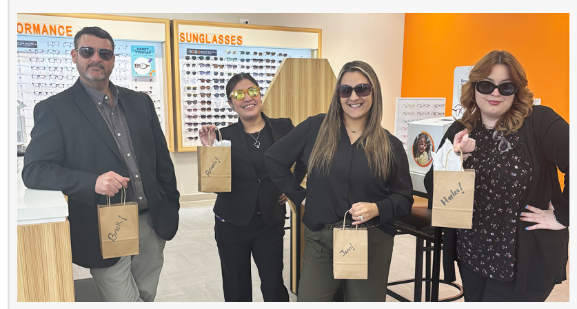
Stanton Optical Victoria Staff Celebrating Grand Opening

Stanton Optical: We Make Eye Care Easy, Accessible, and Affordable for All