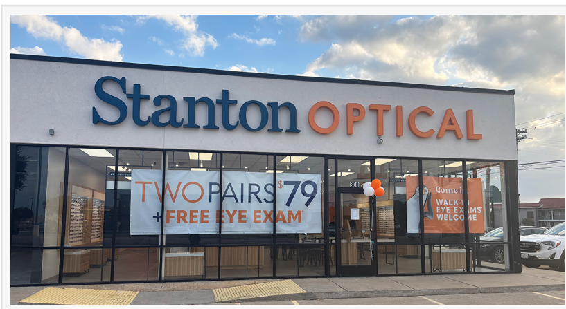
Stanton Optical Victoria - Your Ultimate Destination for Glasses, Contacts, and Sunglasses

VICTORIA, TX, UNITED STATES, November 25, 2024 / EINPresswire.com/ -- Stanton Optical, a pioneer in affordable and accessible eye care, announces the grand opening of its latest store in Victoria, on November 18. This new addition at 7804 N Navarro St, Suite 300, Victoria, TX 77904 strengthens Stanton Optical's commitment to delivering on its