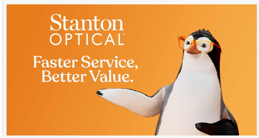
Meet Stan the Penguin, Stanton Optical's Brand Ambassador – Discover Unbeatable Offers at Stanton Optical Victoria Store Before They're Gone!

The new location is less than 2 miles from Ethel Lee Tracy Park and walking distance from