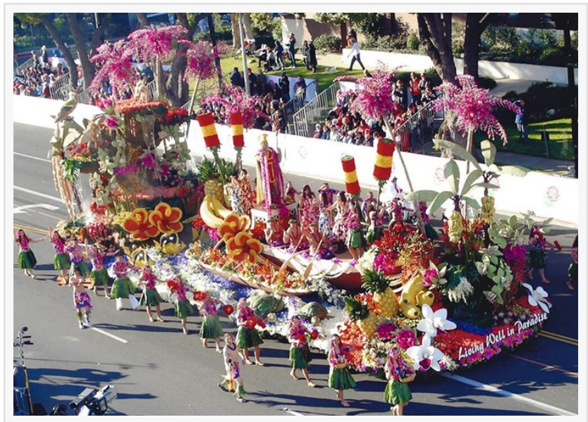
rose bowl trip packages

As the New Year approaches, anticipation builds for the spectacular events that take place in Pasadena, California. The Rose Parade, known for its stunning floral floats and vibrant performances, will be held on January 1, 2025. This iconic event draws thousands of spectators from across the nation, celebrating the beauty of nature, creativity, and community spirit. Attendees can witness the grand parade featuring magnificent floats decorated with thousands of flowers. seeds, and other natural materials, alongside talented bands and performers.