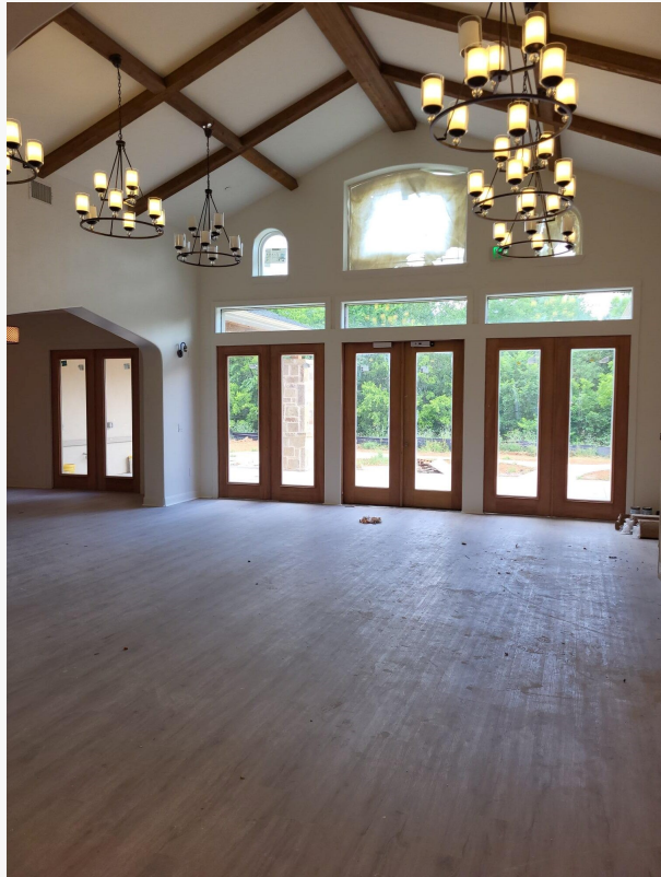
Memory care facilities Highland Village

""Village Green is structured on the absolute best care and beautiful home environment for anyone's loved one that is going through memory care diseases. They are very knowledgeable, well-trained, and are so very compassionate to each individual's different needs. I absolutely love Village Green. I would place my own mother there, and I'd pray my children would do the same