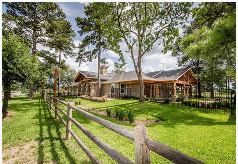
champion assisted living