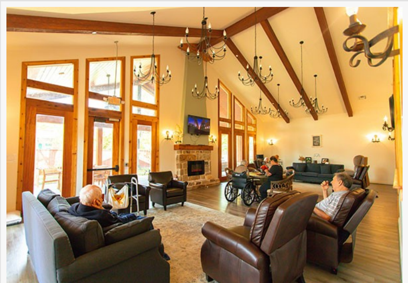
Memory care facilities Champions