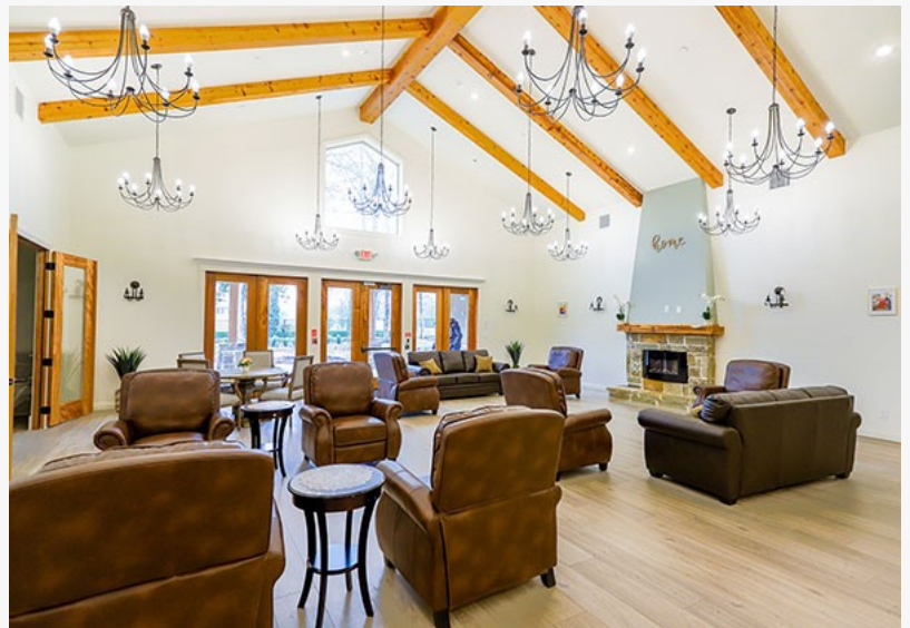
Elderly memory care The woodlands