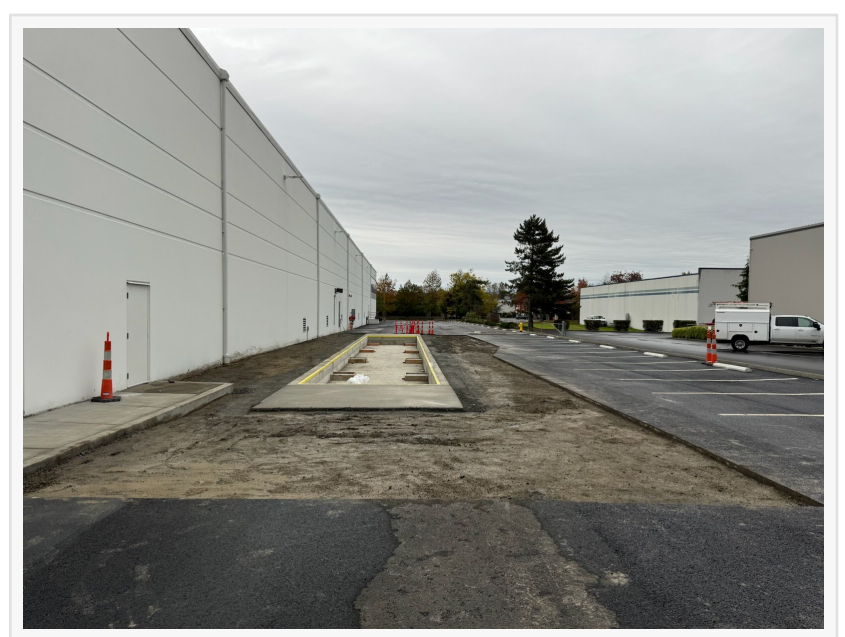
Weight Scale for Trucks Excavation Project in Tacoma, WA

Recent notable projects include the successful completion of several major commercial site preparations in downtown Tacoma, where precise grading and expert land management were crucial. In Pierce County, the team recently handled multiple residential excavation projects, showcasing their ability to work efficiently in diverse terrain conditions while maintaining strict environmental compliance.