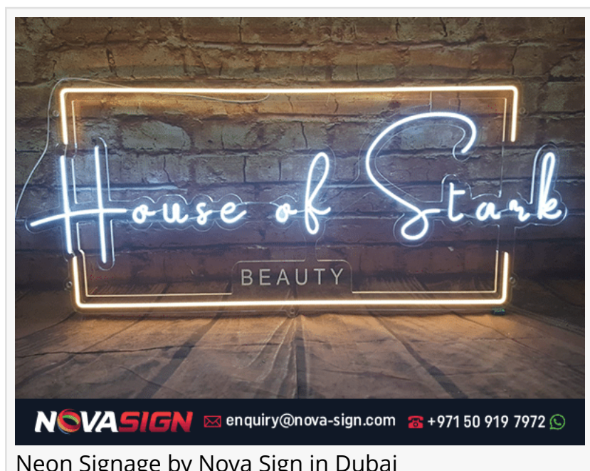
Neon Signage by Nova Sign in Dubai

DUBAI, AL NAKHAL ROAD, NAIF, UNITED ARAB EMIRATES, November 21, 2024 /EINPresswire.com/ -- The demand for striking visual branding is soaring across Dubai, and businesses are increasingly turning to neon signs to make an unforgettable impression. Nova Sign Printing is at the forefront of this transformation, offering stunning and customizable neon sign solutions designed to elevate brand presence and visibility.