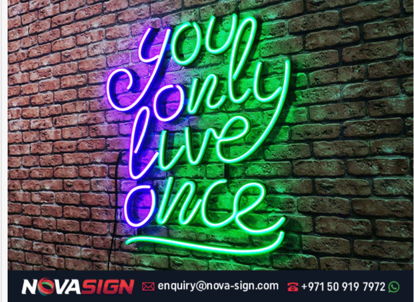
Neon Sign by Nova Sign in Dubai

These signs can be designed in various colors, shapes, and sizes, offering unparalleled flexibility. Whether it's a dynamic logo or a simple slogan, neon signage creates a lasting impression.