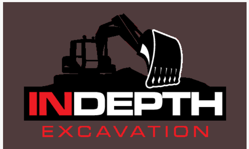
Indepth Excavation's Logo

and soil conditions, combined with our team's 60+ years of combined expertise."