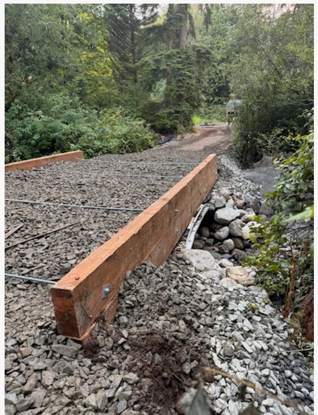
Gravel Installation and Excavation Job in North Seattle Washington with Indepth Excavation

The company has established strategic partnerships with leading construction firms throughout the region, ensuring seamless project coordination for developments of all sizes. Their work spans from