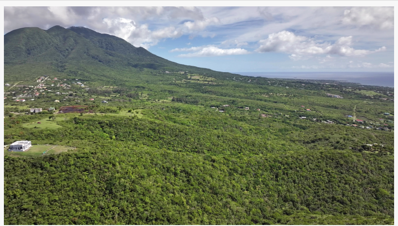
Ridges of Spring Hill