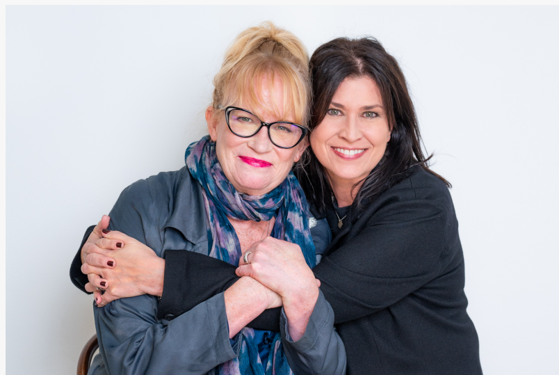
Johanna Day and Nancy McKeon, opening cast of Pen Pals in NYC