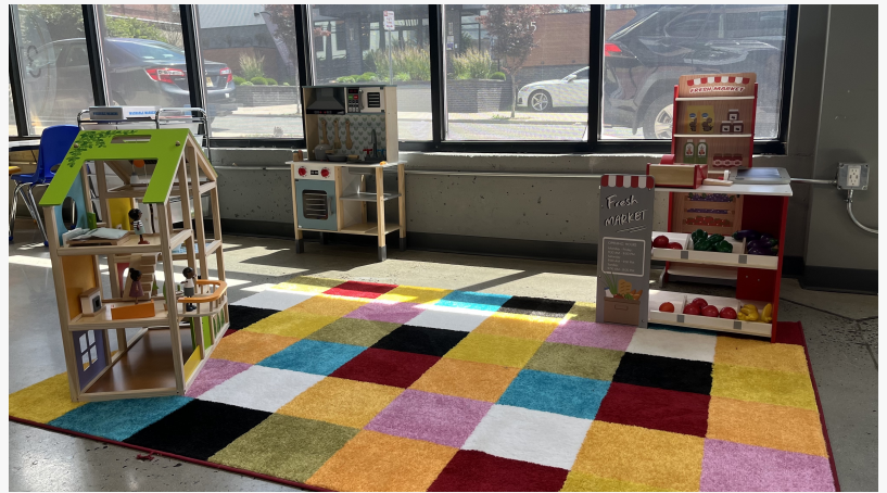
Brewerytown Location Play Area