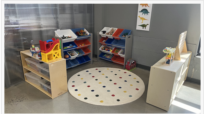
Brewerytown Location Circle Time

Michele Welch Acclaim Autism +1 267-281-9529 email us here