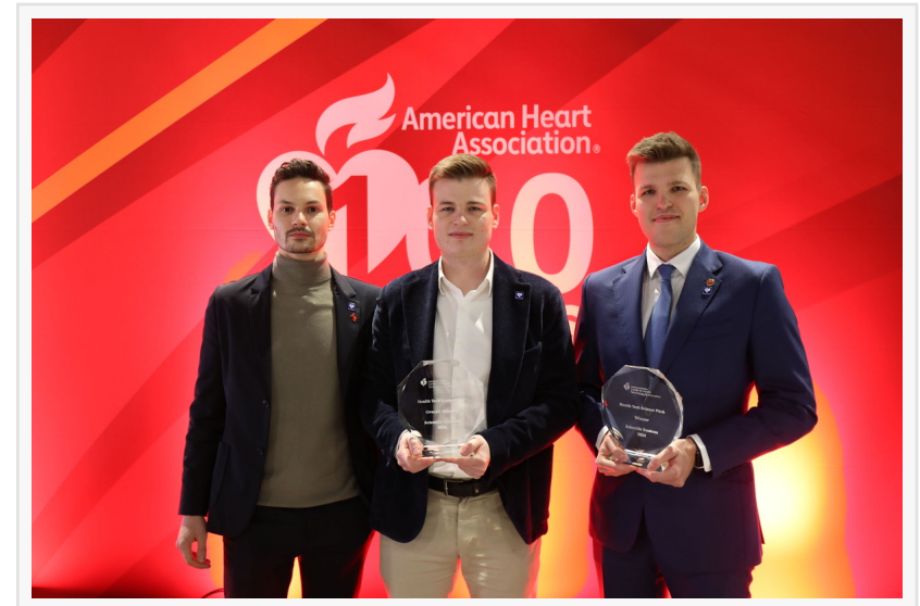
Powerful Medical is the first ever to win Best Science Startup and Overall Winner at the prestigious AHA 2024 Health Tech Competition.

For more details about the AHA Health Tech Competition and other winners, visit: <a href="https://newsroom.heart.org/news/ny-ai-medical-company-wins-global-health-tech-competition-">https://newsroom.heart.org/news/ny-ai-medical-company-wins-global-health-tech-competition-</a>