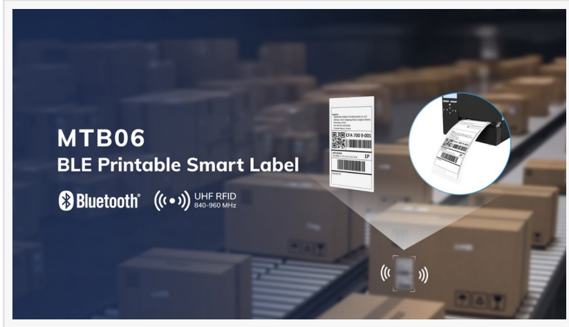
MTB6 BLE Printable Smart Label

IRVINE, CA, UNITED STATES, November 22, 2024 /EINPresswire.com/ -- In today's world of booming e-commerce and logistics, billions of packages are transported daily via air, sea, and land. As package volumes soar, the demand for real-time tracking has become essential for shippers, logistics companies, and end recipients. Traditional RFID tags, however, often lack real-time positioning capabilities, leading to lost parcels during transit. To address these challenges, world's leading IoT device manufacturer and innovator Minew, in partnership with innovative wireless connectivity SoC provider <u>InPlay</u> Inc., introduces the latest MTB06 BLE flexible printable smart label. This smart label, powered by cutting-edge <u>IN100</u> NanoBeacon™ SoC, provides users with a powerful tracking device designed to meet the demands of modern logistics.