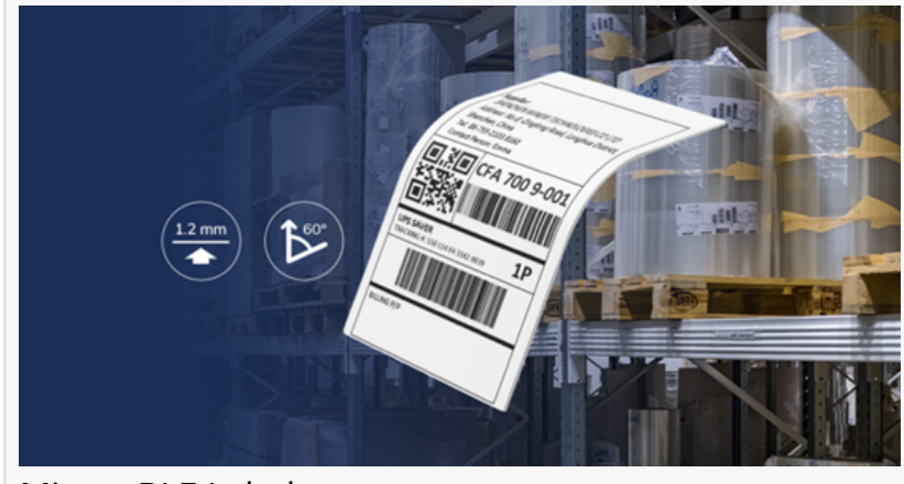
Minew BLE Label