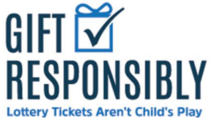
Gift Responsibly Logo