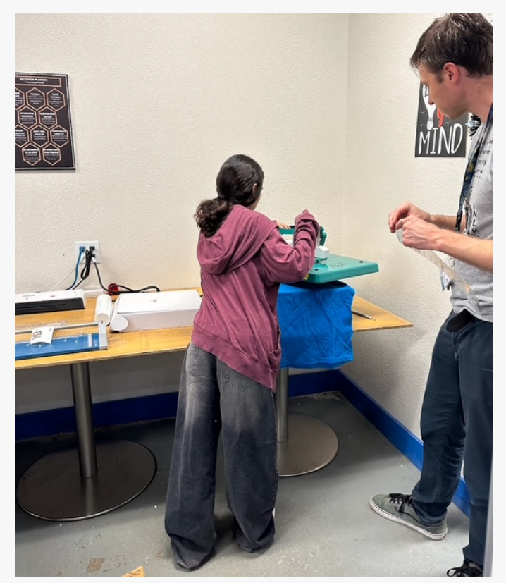
AYW-YB Taylor participants learn manufacturing skills through on-site projects.

Join us in celebrating the achievements of AYW-YB Taylor and support the continued growth of this workforce development program. Visit <u>GiveTaylor.org</u> during the Day of Giving on December 3-4 to donate and help us offer more young people in rural communities the opportunities they