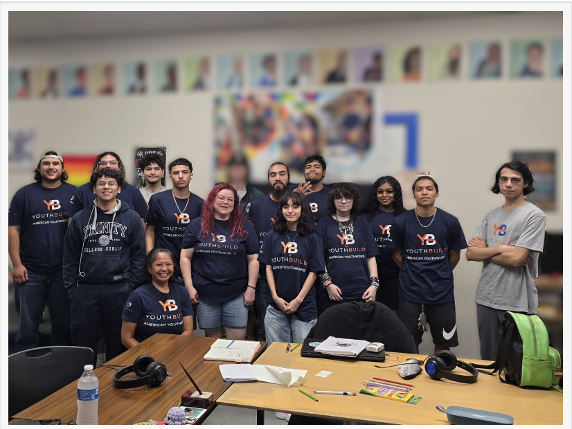
AYW-YB Taylor participants in classroom. *Participants who are blurred out have opted out of having their identities shared, we are respecting the participant's privacy*

TAYLOR, TX, UNITED STATES, December 3, 2024 /EINPresswire.com/ -- American YouthWorks YouthBuild (AYW-YB) Pre-Apprenticeship paid career training program is dedicated to supporting young people through education, job training, and leadership development. We are thrilled to celebrate a successful first year at our newest operating site in Taylor, Texas. Since its launch, AYW-YB Taylor has expanded paid career training opportunities to rural communities, providing program participants with the technical skills and industry certifications necessary to enter today's competitive job markets.