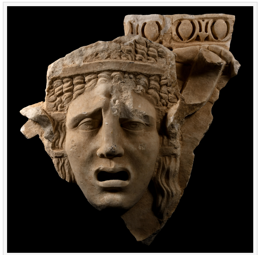
Large 2nd century AD Roman marble relief of female tragedy theatre mask modeled in the half-round. Possibly used as a corbel or lintel. Academic report by Dr. Raffaele D'Amato. Estimate: £8,000-£10,000 ($10,100-$12,630)

The auction includes several exceptional artworks featuring female subjects. A stunning 14th-century