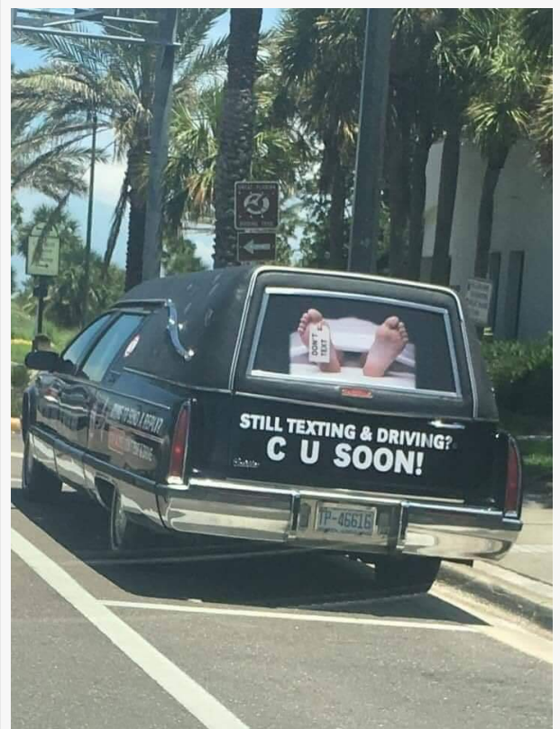
Heaven can wait. DON'T drive destructively!