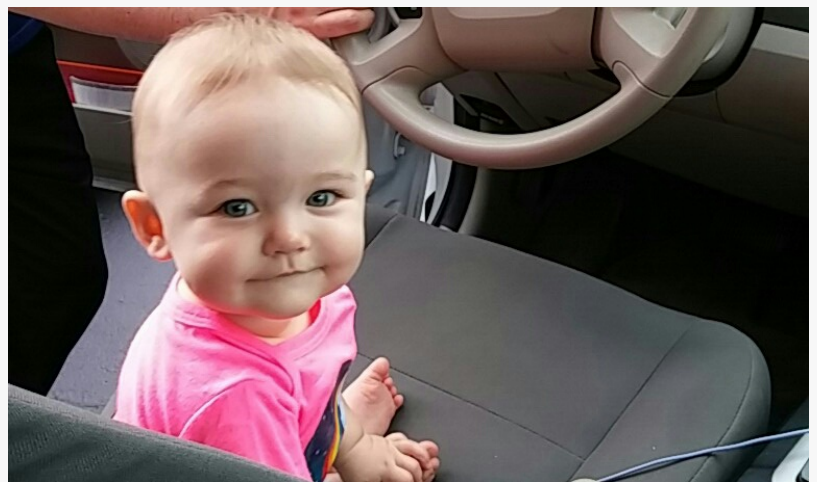
Infant behind the wheel. If we can educate early, we will have success.

EINPresswire.com/ -- Americans United Against Destructive Driving (AUADD), a 501C3 teen highway safety education charity, is urging railroads and municipalities to take immediate action in preventing train and vehicle deaths. With the recent increase in fatal accidents involving trains and vehicles, AUADD is calling for a collaborative effort to prioritize highway safety and save lives.