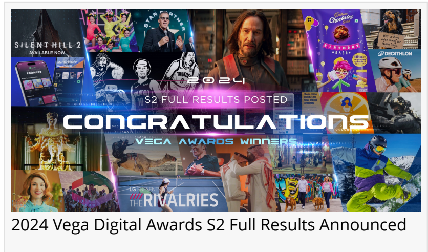
2024 Vega Digital Awards S2 Full Results Announced

EINPresswire.com/ -- The second competitive season of the 2024 Vega Digital Awards has come to a close, unveiling a distinguished list of winners from around the globe. With a focus on celebrating excellence in digital media, the awards attracted over 1,300 submissions from 23 countries, representing a wide array of categories.