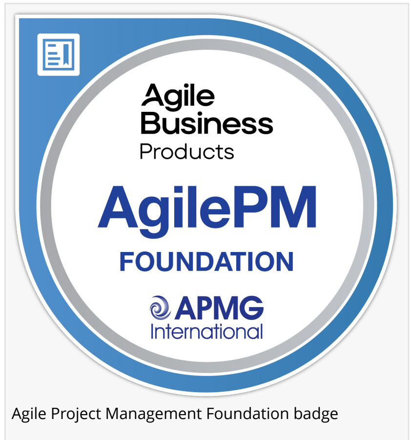
Agile Project Management Foundation badge

AgilePM's effectiveness is evident in the results of APMG's 2024 survey of AgilePM candidates; over 96% of respondents would recommend the AgilePM framework to other organizations and