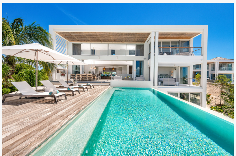
Beach Enclave Grace Bay Villa 3

EINPresswire.com/ -- As the colder months approach and holiday season begins, Beach Enclave Turks & Caicos invites travelers to an island immersion amongst the turquoise waters of Providenciales, Turks & Caicos. Situated across North Shore, Long Bay, and Grace Bay, Beach Enclave features luxurious villas and beach houses designed to connect travelers to each location. Offering an exclusive Cyber Sale this holiday season, Beach Enclave will be providing up to 30% savings on selected villas and beach houses when booked between November 29 and December 6, 2024 for travel from April 22 - December 20, 2025 (blackout dates are from November 24 to 30, 2025). Boasting two to seven bedrooms with private infinity pools, outdoor showers, and luxury amenities, the beach houses and villas are designed to cater to the growing trend of togetherness. Just a short ride between each location, Beach Enclave invites guests to explore what each destination offers.