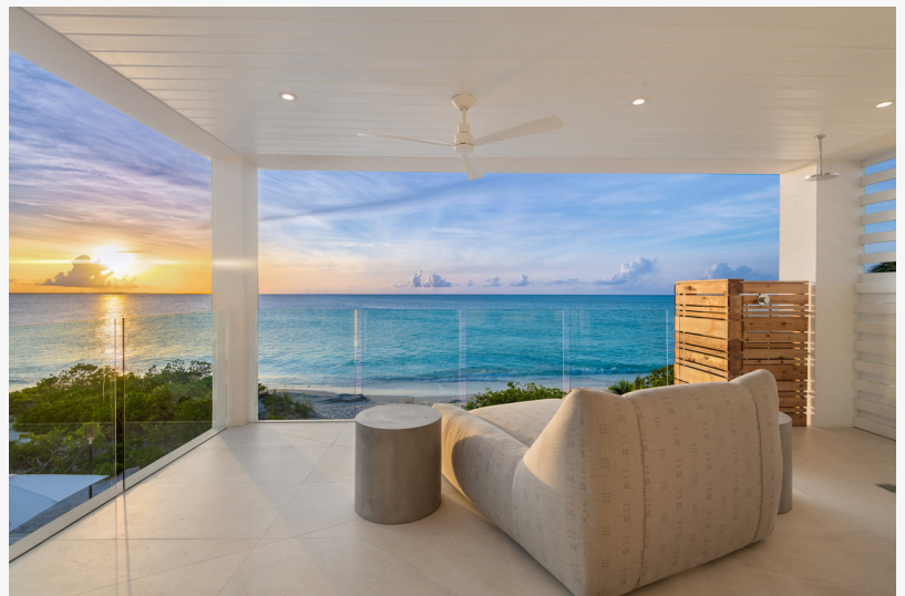
Beach Enclave Grace Bay Villa 1

Set on 20 acres of indigenous landscape, North Shore features a marine reserve ideal for snorkeling. With 10 new three and four-bedroom contemporary beach houses opened in December 2023, North Shore welcomes couples and smaller groups for an intimate island escape with a nature-focused design that immerses guests into the surroundings. Beyond