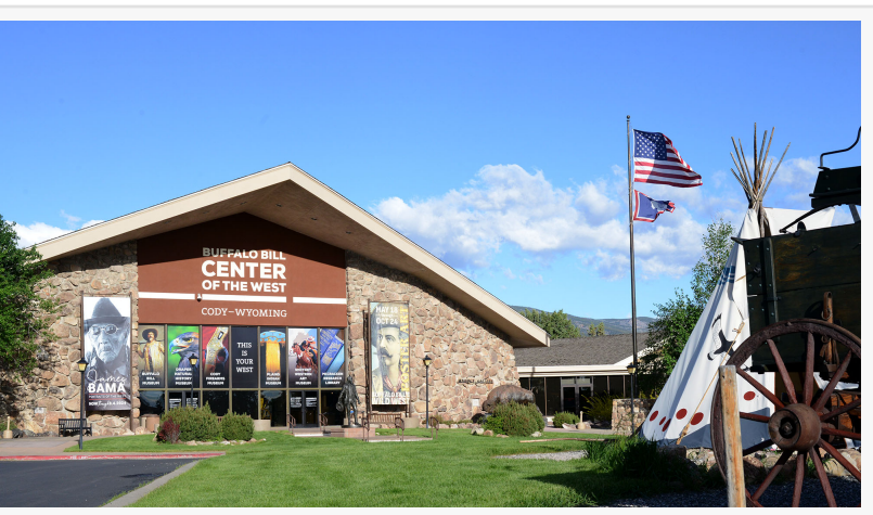
Facade of the Buffalo Bill Center of the West

"POP! Goes the West" is more than just eye candy—it's a conversation starter,