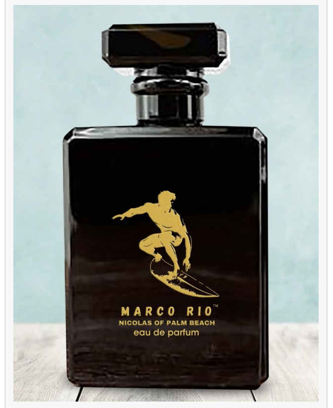
Marco Rio Fragrance