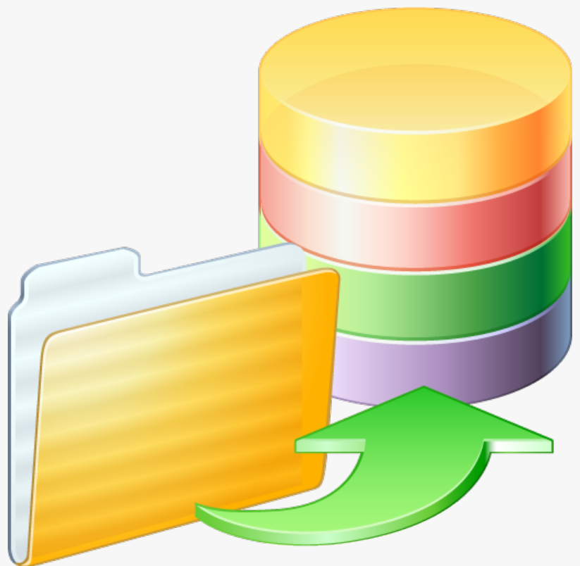
FmPro Migrator Icon