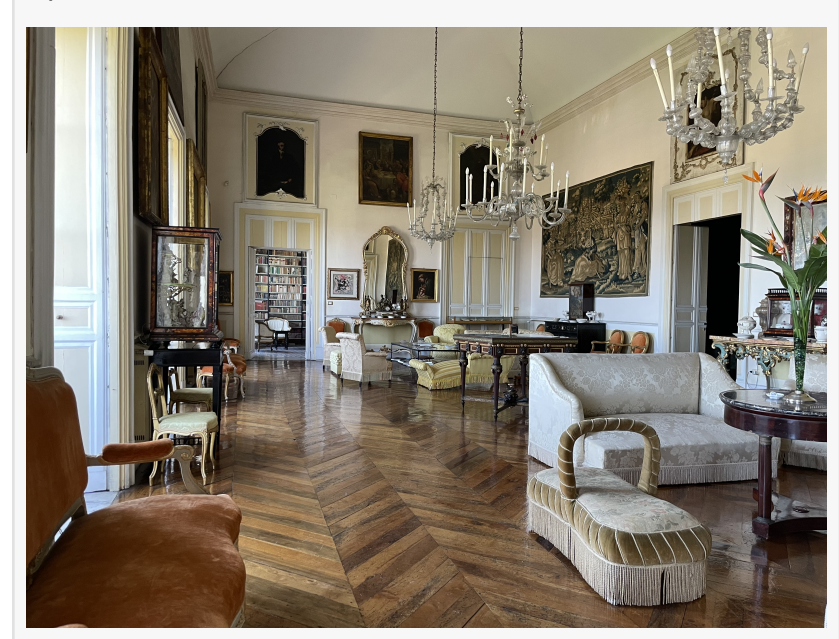
The Ballroom in Palazzo Lanza Tomasi

enjoying an Aperol Spritz for just 3 euros, nomads can experience the epitome of Italian leisure and gastronomy at an affordable cost. This blend of work, culture, and community creates a uniquely appealing proposition for digital nomads.