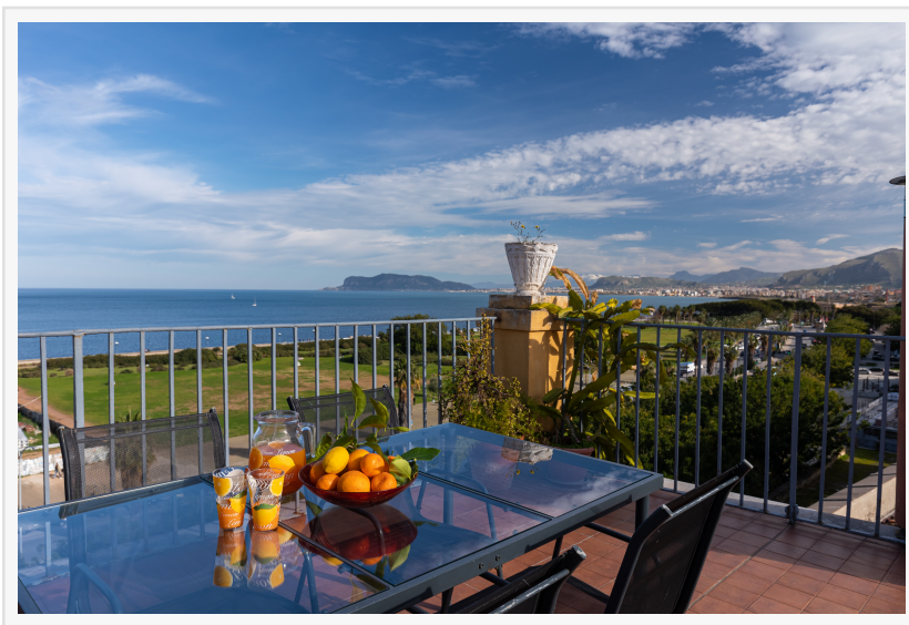
Apartment 9's Private Terrace with views of the sea

The Sicilian lifestyle adds an extra layer of appeal to Butera 28 Apartments' accommodations. From gourmet aperitivo in every restaurant to