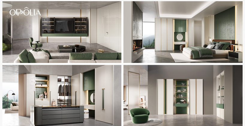
oppolia whole-house designs