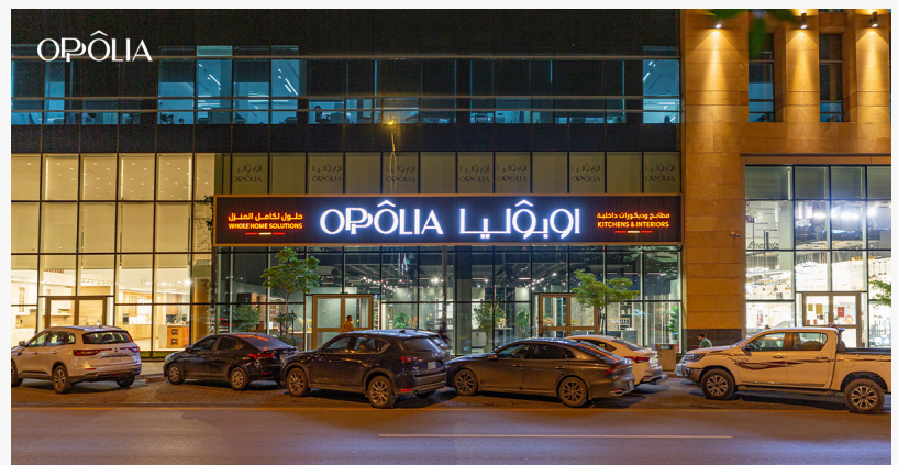
oppolia middle east dealer stores