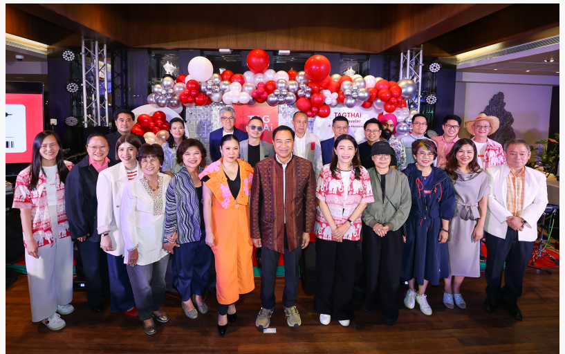
TAGTHAi gathered with more than 40 remarkable stakeholders and organizations to express gratitude for collaborations and accomplishments