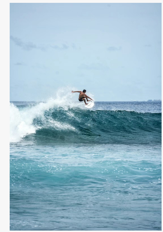
Riding the Waves at Pasta Point