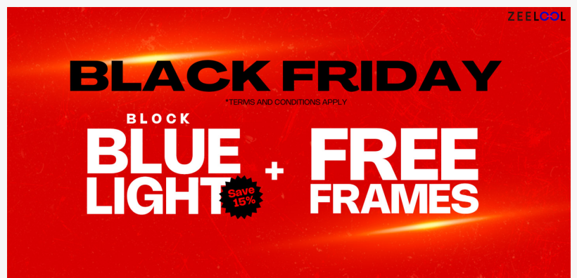
ZEELool Free Frames