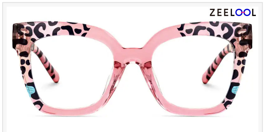
ZEELLOOL Frames Glasses