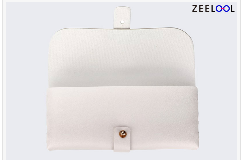
ZEELLOOL free gift