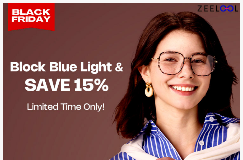
ZEELool Block Blue Light & Save 15%