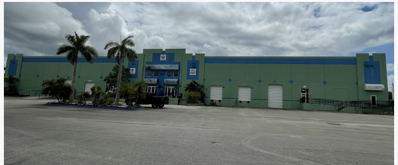
H2Ocean Corporate Headquarters at Stuart, Florida