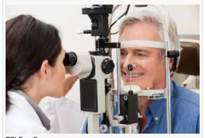
TEI Eye Exam

1. Schedule Comprehensive Eye Exams: Comprehensive eye exams not only update