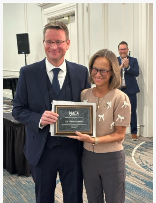
Recognition of Outstanding Leadership and Service as President of VMEA (2022-2024)