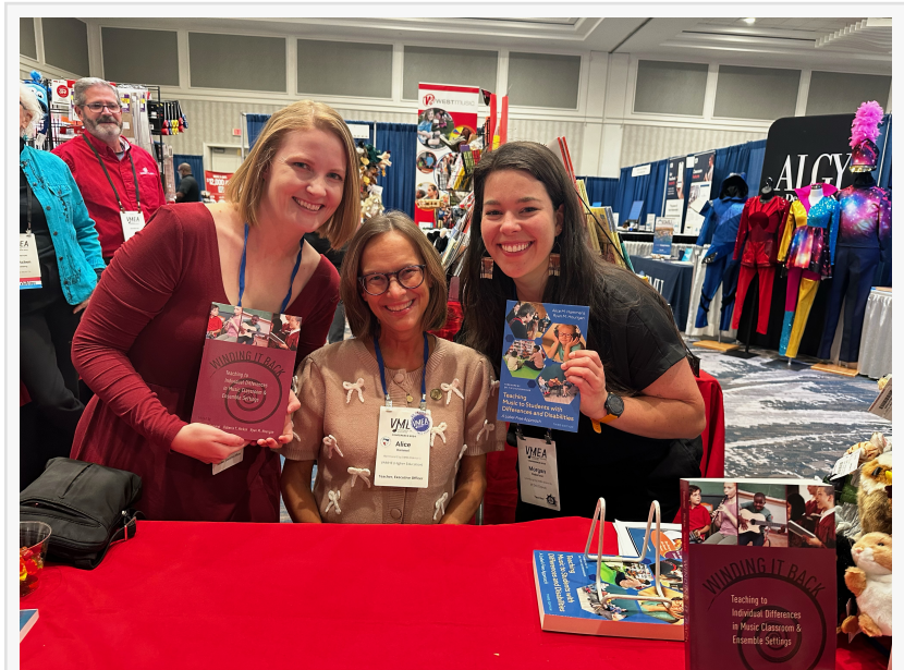
Book Signing at the Virginia Music Educators Association: VMEA Conference

Students with Differences and Disabilities: A Label-Free Approach," "Teaching Music to Students with Differences and Disabilities: A Practical Resource" and "Universal Design for Learning in Music Education."