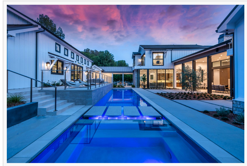
'Stalla Dolce', 25057 Lewis and Clark Road, Hidden Hills, Los Angeles Area, California

An ultra-modern estate in the prestigious Edenbridge Humber-Valley neighborhood of Toronto, 91 Valecrest Drive is a masterpiece in design. Positioned against the serene backdrop of ravine views, the residence exudes sophistication with European-imported finishes throughout. The stunning Italian-imported kitchen, complete with a butler's pantry and top-of-the-line appliances, offers an elevated culinary experience. Soaring