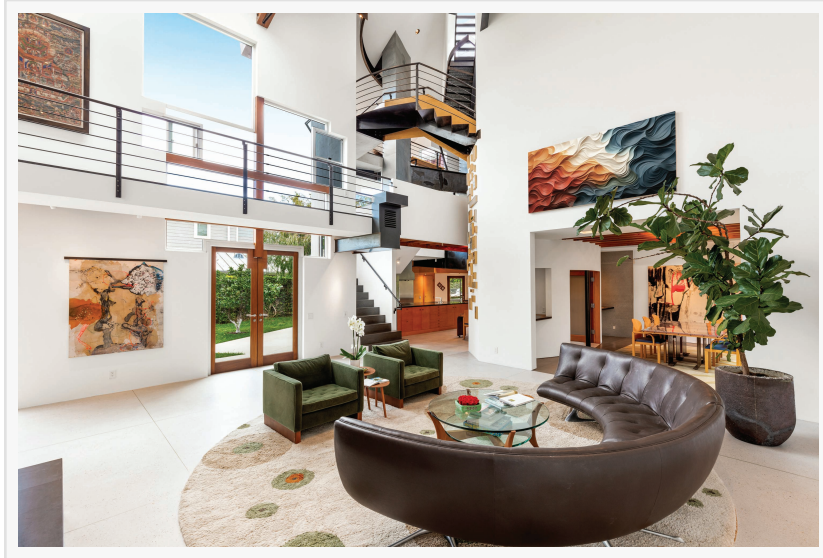
'Constellation 167', 167 South Westgate Avenue, Los Angeles, California

Set on over two acres, this ornate palace in the prestigious Sandy Springs residential enclave of Atlanta, Georgia is a supreme reproduction of the neoclassical architectural style that swept Europe in the 1700s. The property mirrors the exterior design of