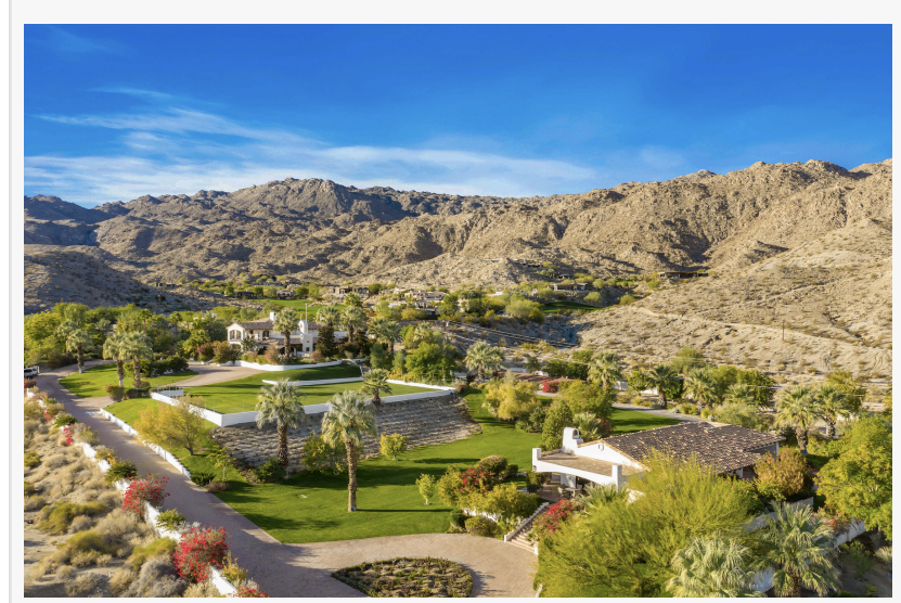
71555 Jaguar Way, Palm Desert, California

Paris's Le Petit Trianon chapel in Versailles. Passing through wrought iron gates, visitors are greeted by meticulously landscaped gardens and a two-story marble entrance hall with an elegant black marble fountain. The main living spaces exude timeless elegance, evident in the banquet-sized formal dining room adorned with chandeliers. Perfect for entertaining, visitors can explore an elegant wood-paneled library/office, a grand kitchen complete with all high end appliances, or the grand living room that opens to the walkout pool and spa terrace. An enclosed breezeway connects the pool house and the home's main level, which includes a gym, wine cellar and family room overlooking the walkout pool and spa. Featuring seven bedrooms and 11 bathrooms, the property makes for a versatile option as a palatial retreat or an elegant setting for hosting guests.